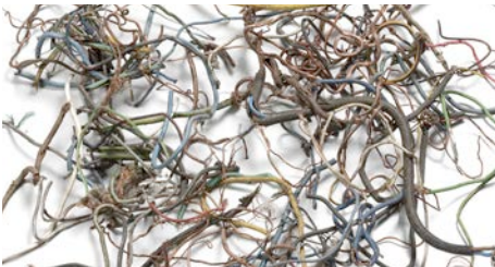
CM-Sensor – "Inverse Sorting" technology with shape recognition