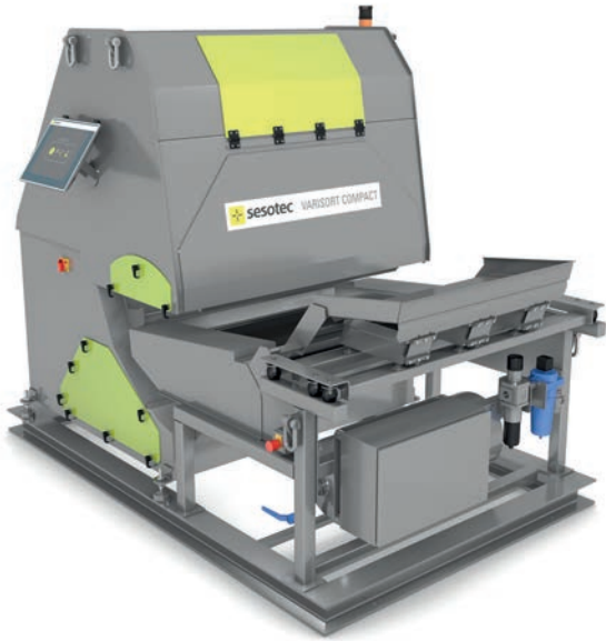
VARISORT COMPACT for fine fractions