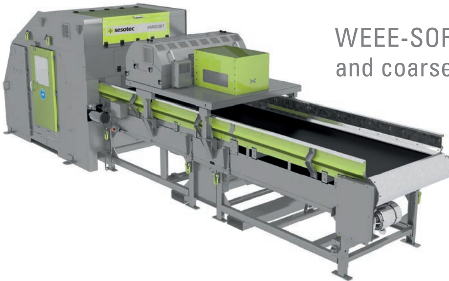
WEEE-SORT for middle and coarse fractions