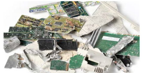
CMN-Sensor – All in one