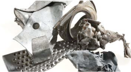
M-Sensor – Recovery of metals