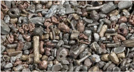
C-Sensor – Color separation