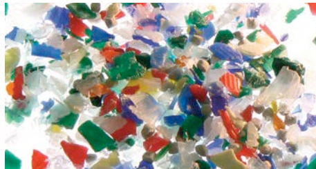
CN-Sensor – Off-color and material separation