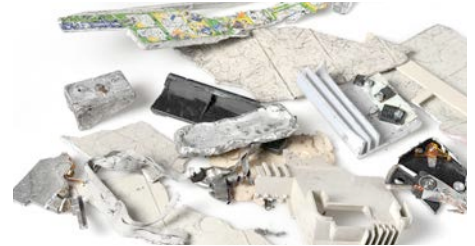
N-Sensor – Recovery of engineered plastics